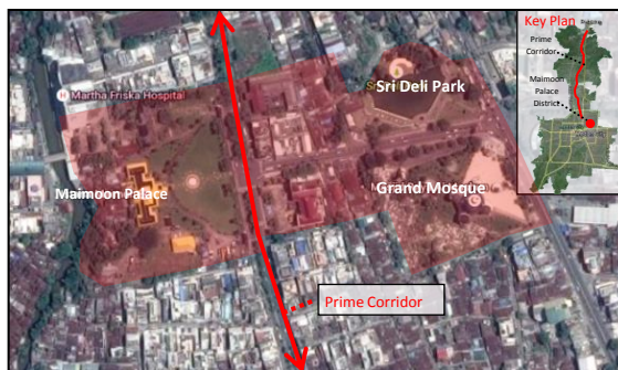
Figure 1: Maimoon Palace Heritage District

This research was conducted in Maimoon Palace Heritage District, Medan City. It is located on BrigjenKatamso St. and Singamangaraja St. which is the prime corridor of Medan City (Figure 1).