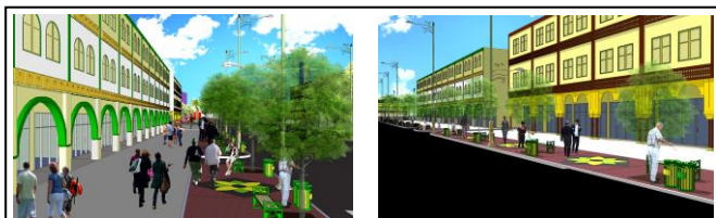
Figure 4: Malay Ornaments in Design of Building Facade and Street Furniture

Although respondents give a positive assessment, the existences of historic buildings should be kept well-maintained as a preservation effort. Maimoon Palace heritage district condenses on Malay culture that can be seen through the esthetic values of Malay ornaments.