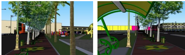
Figure 5: The Supporting Facilities in Research Area

In preserving self-efficacy, the additional elements should be provided to increase the satisfaction of both local people and tourists. The bins and seating facilities should be placed in certain range along the Maimoon Palace Heritage District (Figure 5).