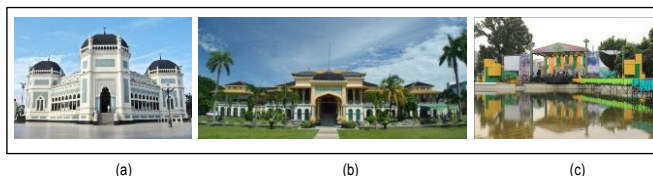
Figure 2: (a) Grand Mosque; (b) Maimoon Palace; (c) Sri Deli Park

Maimoon Palace Heritage District was selected due to well-known historical objects which is evidence of authority of Malay Deli kingdom in past, namely Maimoon Palace, Grand Mosque, and Sri Deli Park (Figure 2). Moreover, a prime corridor in a city always becomes heritage tourism component, especially to the historic corridor (Prideaux; Copper, 2002). Therefore, Maimoon Palace Heritage District should be well-planned to strengthen the characteristic of the area due to its potential of heritage tourism development.