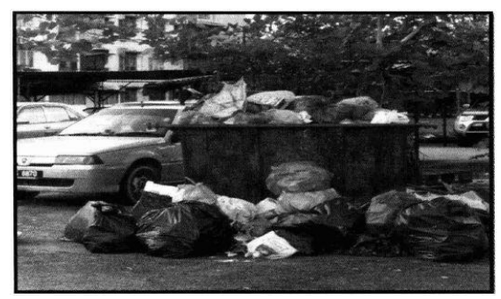
Figure 6: Mean ratings: "1.10, b1.44, c1.10