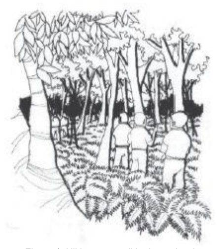
Figure 1: Hiking on a trail in the orchard

(Figure 1), picking durian fruits, plucking leaves, climbing slippery slopes, holding tree lets and rattan climbers, climbing slopes, ducking under a fallen log, picking pebbles from the stream bed, throwing pebbles on the water surface and throwing stones to a tree trunk. The utilised activities were associated with perceived ones such as feeling cold while swimming in the stream, observing bulbuls and magpie robins while swimming in the stream, watching peers searching for shrimps in the stream, and scanning and avoiding thorny rattan plants while climbing down the slopes. An example of a utilised activity was picking young durian fruits from under the trees in the orchard. An eight-year old boy collected the fruits and held them from their stalks, about three to five fruits in one hand. He said, "Look, nice and beautiful" to another five year old peer. "The spikes are soft, it is light" replied the younger peer. This means that the fruit afforded the child to interact and exchange words with his peer, and learn that young fruits were soft to touch and light to carry. This is a social affordance (Kytta, 2003) that generated acquaintanceship between the boys. It means that the boys were fascinated with the elements of the orchard through social interaction.