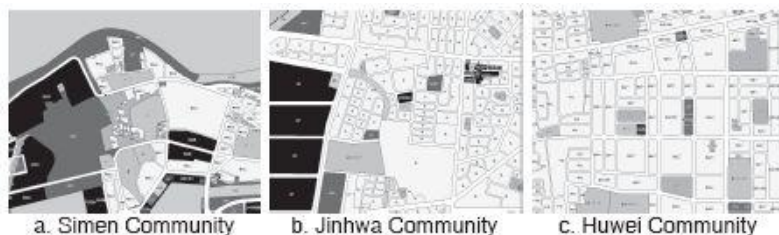
Figure 1: Site Map

Huwei is a relatively modern purely-residential neighborhood featuring 3-4 story row houses, some of which share a courtyard. Streets are laid out on a grid pattern, and main roads are 12-20 meters wide.