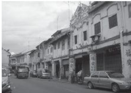
Figure 3: Shop houses arranged in rows

The indication of the result of the main survey was that about one third of the users (31.52%) perceived the shop spaces to be uncomfortable for shopping activities. This finding was confirmed by the outcome of the in-depth interview whereby one quarter (25.0%) of the users perceived the interior of the shop houses to be uncomfortable. The main reasons given by the users relate to the narrowness of the shops and the overcrowding of merchandise arrangement within the shops (38.46% of users in fieldwork and 60.0% of users in in-depth interview). Through observation, it was found that some of the shops, particularly in Jonker Street, were too crowded with merchandise as a result of trying to place as much items as possible within the shop space.