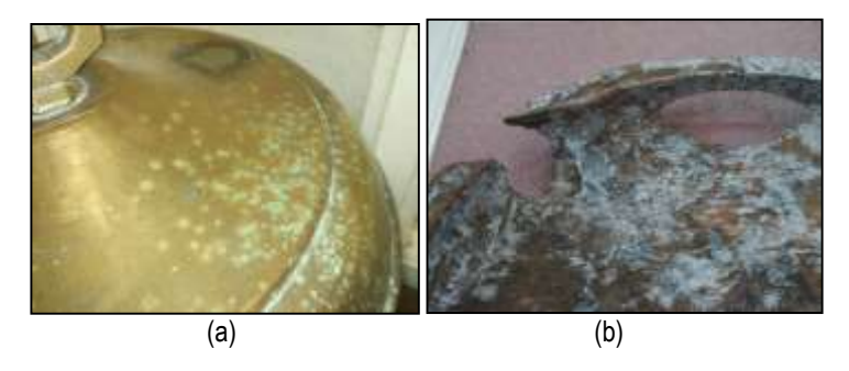
Figure 5 : (a) Bronze disease (b) White rots

Literature reports many degradation cases of heritage objects' constituent materials such as paper, leather, textiles, pigments, and metal by the air pollutions (Puica and Ardelean, 2008). The effects of indoor air pollutions towards materials are different and variety due to the type of pollutants in the air. R Ahmad (2010) stated that the negative impact can occur when the pollutants react with the other environmental factors such as moisture, air, salt, particulate matter, ozone, light, physical wear, washing, sunlight, temperature, microorganism and etc