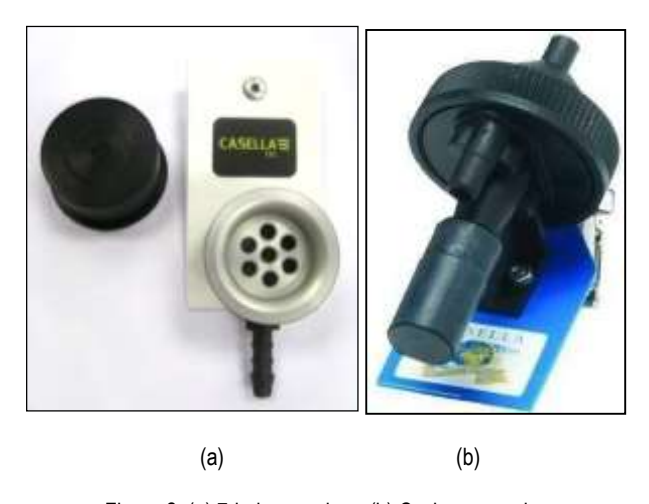
Figure 2: (a) 7-hole sampler; (b) Cyclone sampler

The scientific data collections are expanded further by measuring airborne particulates. The tool and equipments used include Mass Balance, 7-Hole sampler, Cyclone sampler, Calibrators, and other supported tools. Sampling devices wereare used to collect the airborne particulate from a measured volume of air whichair, which wereare measured as mass concentration and reported as milligram of particulate per cubic meter of air (mg/m3). Inhalable 8-hours air sampling are using Casella 7-hole sampler at 2.0 L/min air flow (Fig.2a) and cyclone sampler at 2.2 L/min air flow for respirable 8-hours air sampling (Fig.2b).