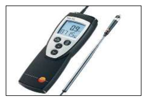
Figure 3: Testo 461