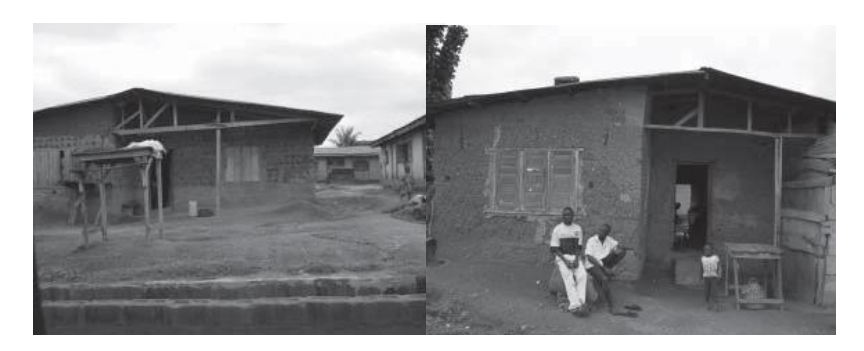
Figure 3: Buildings of Earth Material and Wood Casement Windows in Different Stages of Completion

to other buildings around and other peoples taste. This explains their masking whatever walling material they use in cement/ sand plaster. The houses were in different stages of completion with less than one third (31.6%) fully complete. Most houses have vehicular accessibility problem. The houses were produced more for family use. The indicator is that the number of rooms for the owner occupier had a positive correlation with the number of rooms built and a negative correlation with the rooms rented out. This is corroborated by the finding that the single family occupied house at 31.4% dominated; dual occupancy occurred in 15.6% of the houses, while 3 to 4 households occupied 37.7% of the houses. Renting outrooms was also not necessarily motivated by the need for money since personal income was not a significant predictor variable for renting out rooms among the low income people in Ogbere. Though petty trading was the most common form of home based enterprise, it appeared that it was not done from shops because of the minimal number of shops in the area.