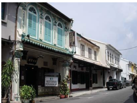
Figure 3: A view along Jalan Tun Tan Cheng Lock

Only a few of the Dutch houses have survived unchanged due to layers of intervention by later occupants that erased most of their original features. In a research conducted by Raja Nafida (2008) it was found that only 112 buildings in the area retain the original façade and interior of the earlier Dutch houses. These can be easily recognised due to the lower height and simpler facade. The historical residential and commercial quarters are located as it stands today. The survey done in 2003 by Malacca City Council noted that the major land use in the historic city of Malacca was commercial (35.76%) followed by residential or row houses (20.63%). The history and the current use of the buildings within the area shows that they have gone through some phases of transformation due to the change of ownership and the changing patterns of life. It also indicates that the historic buildings have the ability to adapt to new needs.