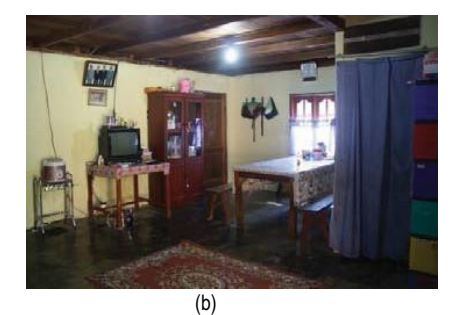
Figure 5: Modern Way of Living (a) Dining Table Set (b) Electronic Utensil and Display Cabinet Source: (Bukit. 2012)

From the physical point of view, modernization is illustrated through selection of materials being used in new buildings. Manufactured materials such as ceramic tile and masonry have replaced bamboo and wooden structure. House on stilts is impractical and inefficient for modern living because people do not keep livestock in the house anymore. The new building is built up on ground level in a typical modern urban house with zinc roof and plastered masonry. When the expansion is two-story high, the lower part is imitating modern masonry construction, yet the upper part is made of wooden structure because of inadequate skill in structural framing. Inside the house, wooden panel is commonly applied for partitioning the space and staircase connecting old house to new building. The roof, in terms of its material, inclination, size and meaning, is the most distinct element that differentiates the appearance of old and new, of original and expansion.