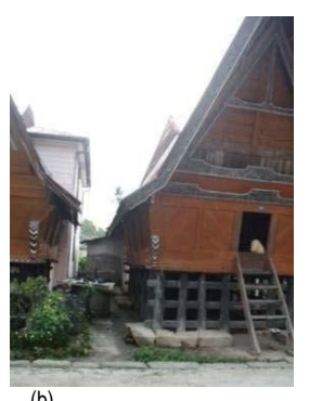
Figure 4: Traditional House (R02 & R03) and its expansion (a) Side Elevation (b) Front Elevation