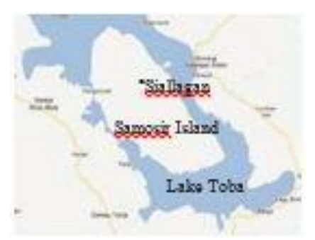
Figure 1: Map of Samosir

The island of Samosir is in the middle of Lake Toba in North Sumatra, and Huta Siallagan is located circa 500 meter away from the lake Toba. The traditional settlement of Huta Sialagan is established by the clan Siallagan amidst of agricultural land, and at present preserved as an exclusively enclosed settlement for the descendants of the clan Siallagan .