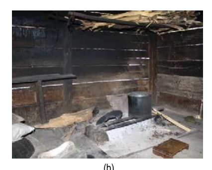
Figure 3: (a) Interior of a Traditional House, (b) Stone Hearth for Cooking