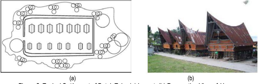
Figure 2: Typical Settlement of Batak Toba (a) Layout, (b) Perspective View of Houses

A Batak Toba traditional settlement is rectangular in form and consists of two rows of buildings (houses and granaries) with in between a multifunction open space (alaman). The house is built on stilts with a steeply rising roof symbolizing three different world in Batak cosmology. The lower part of the house symbolizes the nether world (banua toru) in which devils live. The middle part represents the middle world (banua tonga) where people dwell and undergo their domestic life. The upper part symbolizes the upper world (banua ginjang), as the place for ancestors who protect people's life.