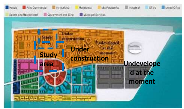
Figure 3: Hulhumale' Land-use Plan