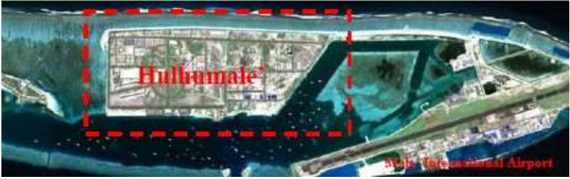
Figure 2: Location of Hulhumale'

Land reclamation works of Hulhumale' started in 1997, and development of physical and social infrastructure and housing commenced in 2002. The settlement started in the middle of 2004, with an initial population of just over 1000 people. The total land area of Hulhumale' is 200 ha with a population of 2,866 (2006). Currently, Hulhumale' has 288 public housing units and 336 row-house units (Figure 3). In addition, land parcels for private housing, industrial development and commercial uses were allocated.