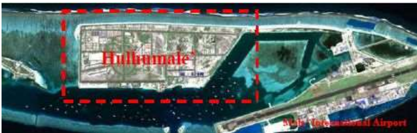
Figure 2: Location of Hulhumale'

Land reclamation works of Hulhumale' started in 1997, and development of physical and social infrastructure and housing commenced in 2002. The settlement started in the middle of 2004, with an initial population of just over 1000 people. The total land area of Hulhumale' is 200 ha with a population of 2,866 (2006). Currently, Hulhumale' has 288 public housing units and 336 row-house units (Figure 3). In addition, land parcels for private housing, industrial development and commercial uses were allocated.